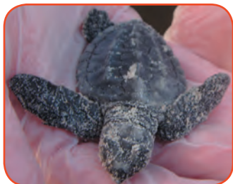
A baby in hand

baby turtles. After the babies are old enough, they are taken to the