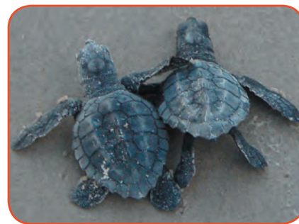
Buddies headed to sea

Why the population explosion? Well, it seems the female turtles have had some help.